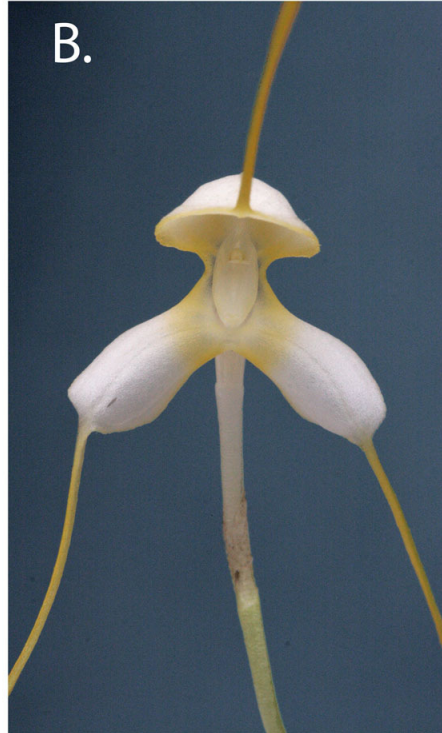
Figure A Masdevallia doucetteana Figure B Masdevallia nivea